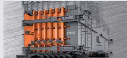
➤ RATEC Battery System