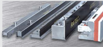
➤ Shuttering systems