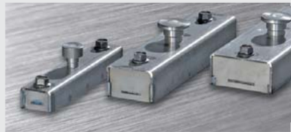
➤ Shuttering magnets