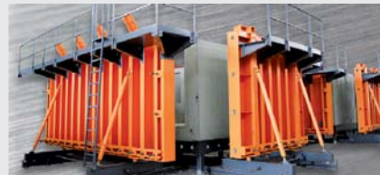
➤ Special shuttering