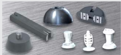
➤ Inserts & Insert Magnets