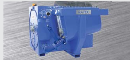
➤ Upcrete® Pump Station

Technical changes reserved | www.bloesch-partner.de 4/13